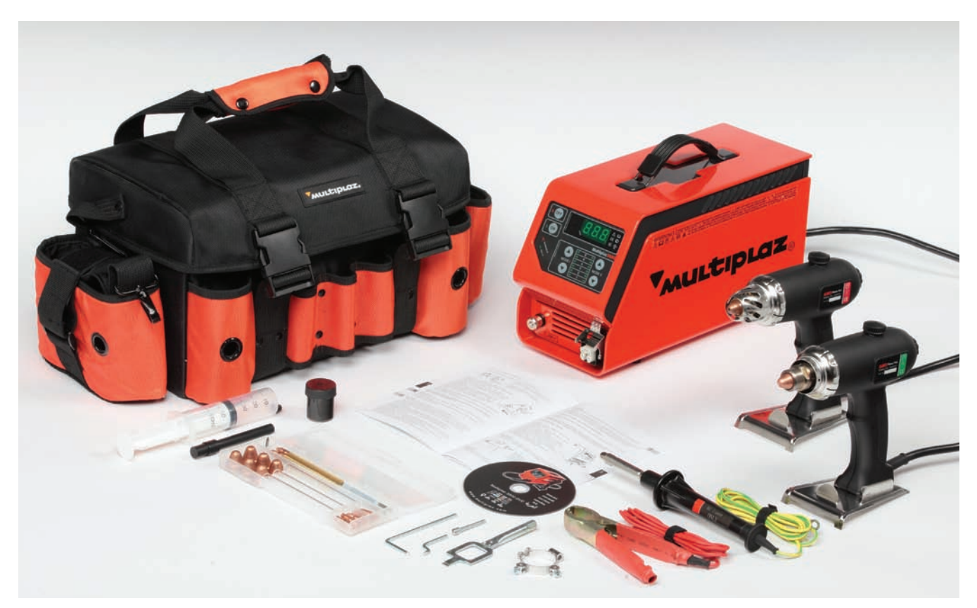
Multiplaz uses a mixture of tap water and rubbing alcohol, considered more environmentally friendly than gas-shielded arc welding. See sidebar below for more info.

make steel molten, and the heat spreads too far, so you wind up really heating up your work and could punch a hole in it or distort it." More modern techniques concentrate heat in a tiny area, he says, so that even though the temperatures are higher, the material cools quickly without a lot of distortion.